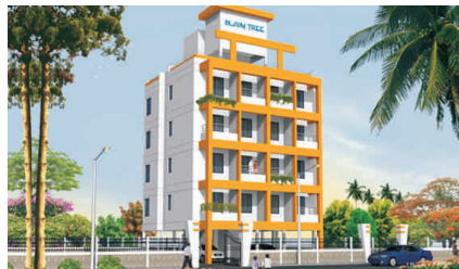
AURUM BLOOM TREE