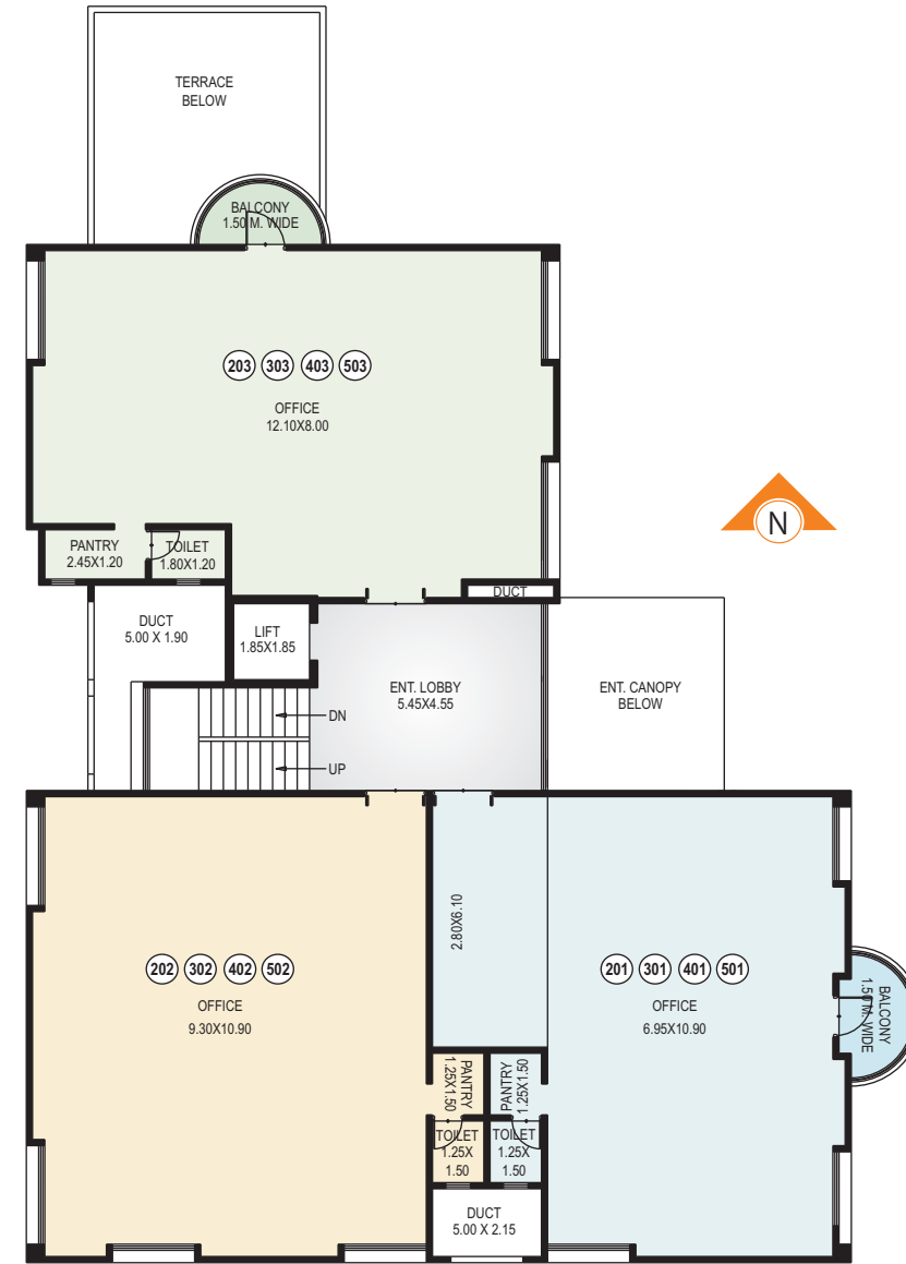
AREA STATEMENT SQ.FT.