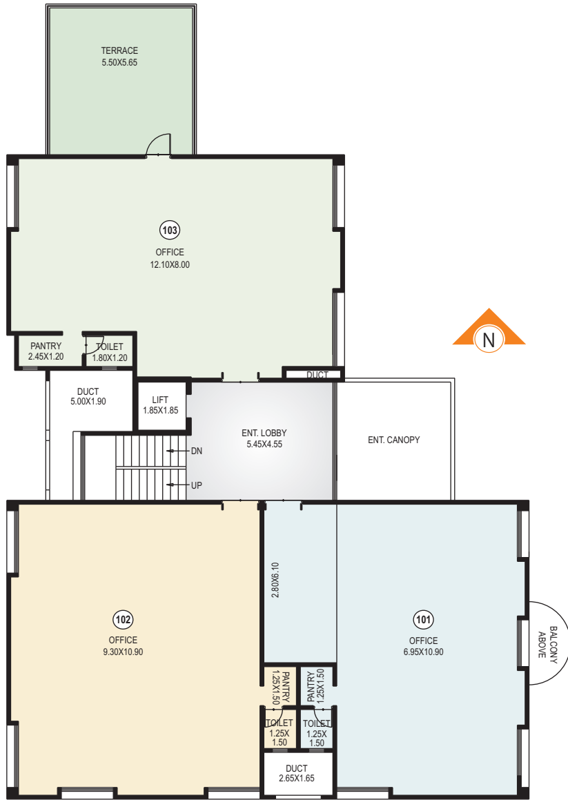
AREA STATEMENT SQ.FT.