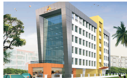
AURUM AKRUTI AVENUE